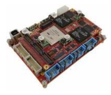
EVP6472: Multicore DSP (Twelve C64x+ processor cores)