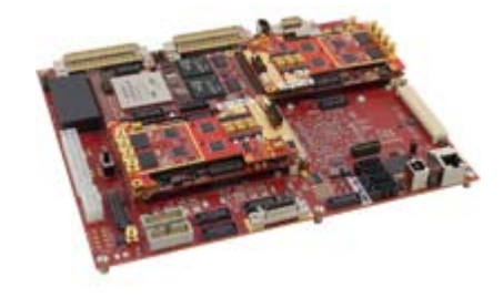
MIMO 4x4 Developer's Board (LTE 2.4GHz and 5GHz ISM)