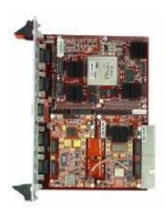
SMT8121: Multichannel UWB (6U cPCI/PXI Software defined)