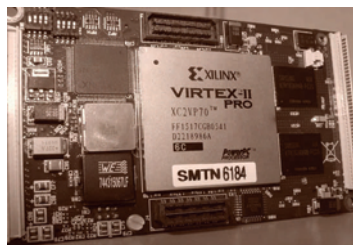
SMT398VP70: up to 2 PowerPCs

Sundance connects to the SMT398VP70 's PowerPC™ 32-bit processor core in its firmware. Now customers can program embedded applications in their FPGA with Xilinx EDK combined with SMT6400 software functions. Up to 2 embedded IBM PPC 405s can allow strong co-processing in the FPGA. The PowerPC 405 embedded-environment architecture adds even more flexibility to your design. Using the mixed DSP, FPGA and Embedded PowerPC combinations provide the "Price/Performance" solution for all aerospace and defence prototypes, wireless communications, multimedia broadcast and industrial control and supervision systems.