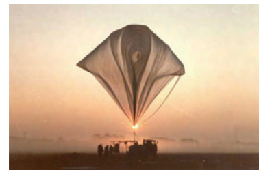
The SUNRISE Long Duration Stratospheric Balloon