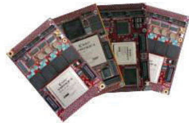
Sundance Virtex-4 FPGAs